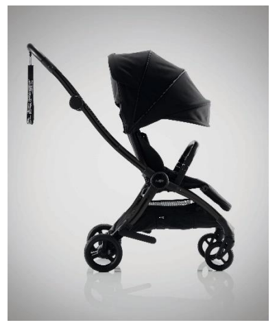
Pictured: Airo Pushchair in Black

Mamas & Papas have launched their most portable pushchair which packs up tight and travels light, perfect for going places. In the car, on the plane or in your favourite coffee spot, getting out and about with baby is easier than ever with their lightest ever pushchair.