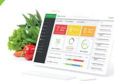
Data Monitoring & Reporting