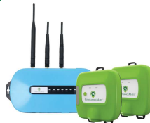
Automated Temp. Sensors