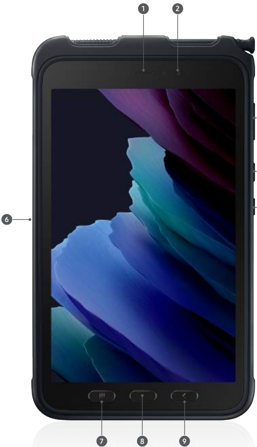
Front with Case