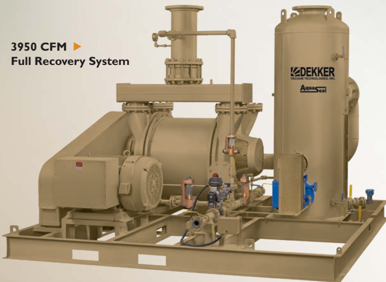
▶ 3950 CFM Full Recovery System