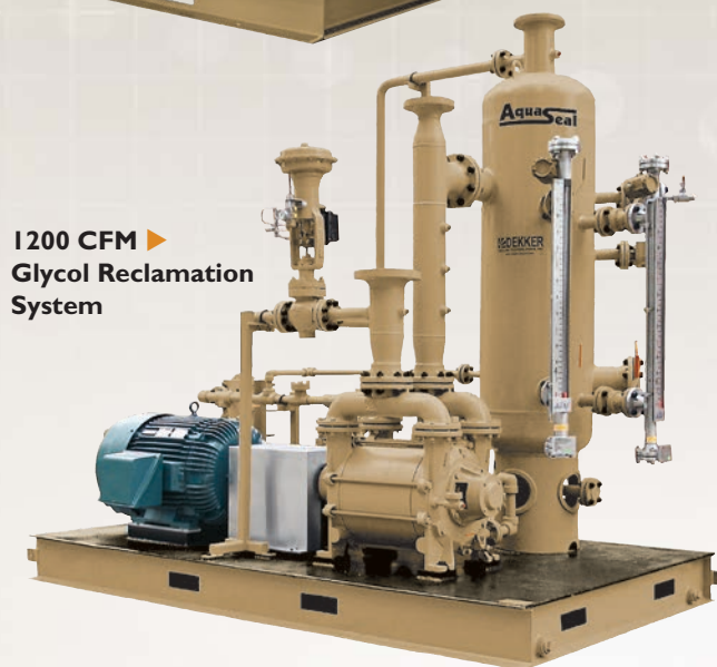
1200 CFM ▶ Glycol Reclamation System

Ask about our Maxima-C conical design two-stage pumps, available from 700-3,000 CFM.