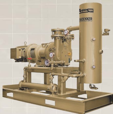
◀ 150 CFM Full-Recovery System

as well as custom-engineered units, to provide you with an economical and reliable solution for a wide variety of today's applications.