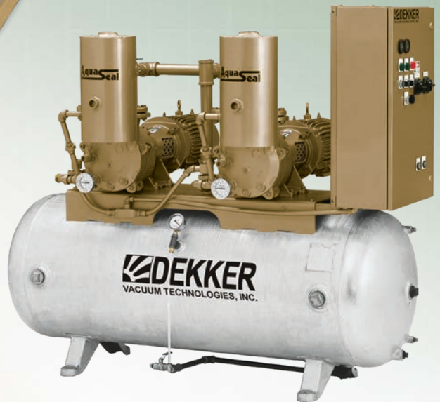
▲ 80 CFM Partial Recovery Duplex System