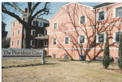
The Providence Center

They are there day-in and day-out. They do it for the many, the few, and even just the one who might feel desperately alone and lost.