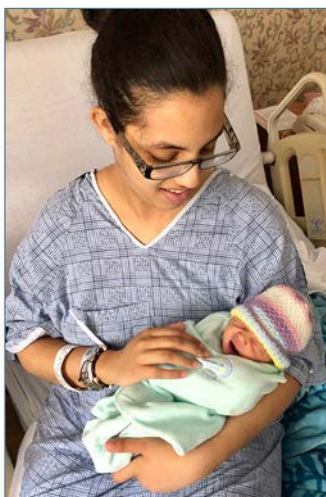
Pictured: First mother and baby to enter the program.

This May, Kent Hospital's Women's Care Center launched the first pasteurized donor human milk program in the state. This program supports breastfeeding families by allowing them the option of providing their infant with pasteurized donor human milk, if supplementation is needed, as a bridge until a mother's own milk is available.