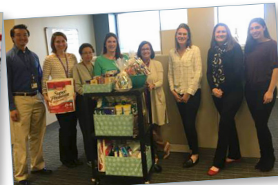
Members of the Women & Infants' Division of Research with their holiday donation to Crossroads.