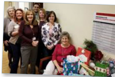
The administrative team from Women & Infants Department of Obstetrics and Gynecology recently got into the spirit of giving, collecting gifts for a family in need at the Obstetrics and Gynecology Care Center (OGCC). Thanks for your thoughtfulness and generosity!