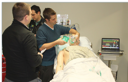
Residents perform a simulation on the SimMan training robot.

training more efficient and realistic for medical students, residents, physicians, nurses, techs, and other clinical personnel.