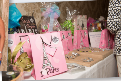
Attendees dropped in their raffle tickets eager to win an array of prizes.