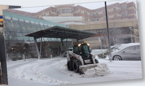
Clearing the snow at Women & Infants Hospital.