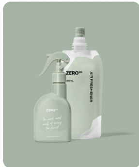
Air Freshener (250mL) + Forever Bottle (250mL)