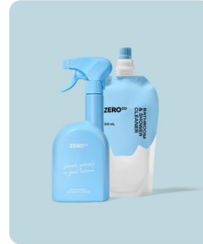
Bathroom & Shower Cleaner (500mL) + Forever Bottle(500mL)