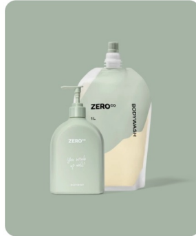
Body Wash (1L) + Forever Bottle (500 mL)