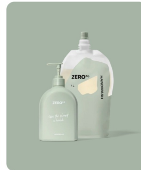
Hand Wash (1L) + Forever Bottle (500mL)