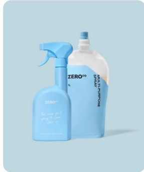
Multi-Purpose Cleaner (1L) + Forever Bottle (500mL)