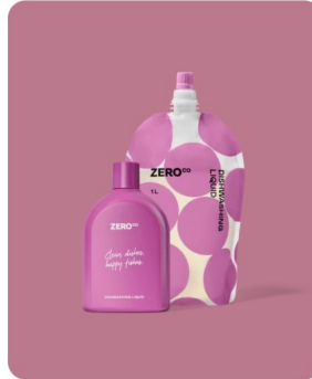
Dish Washing Liquid (1L) + Forever Bottle (500mL)