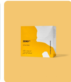
Dishwasher Tablets (50pk)