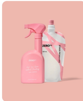
Stain Remover (500mL) + Forever Bottle (500mL)