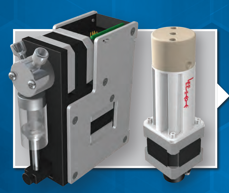
Typical Syringe Pump