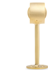
Sleek, straight, and secure design.