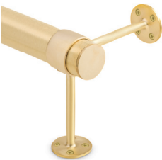
Dependable support for metal tubing.