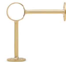
Perpendicular arm and foot for equal contact.