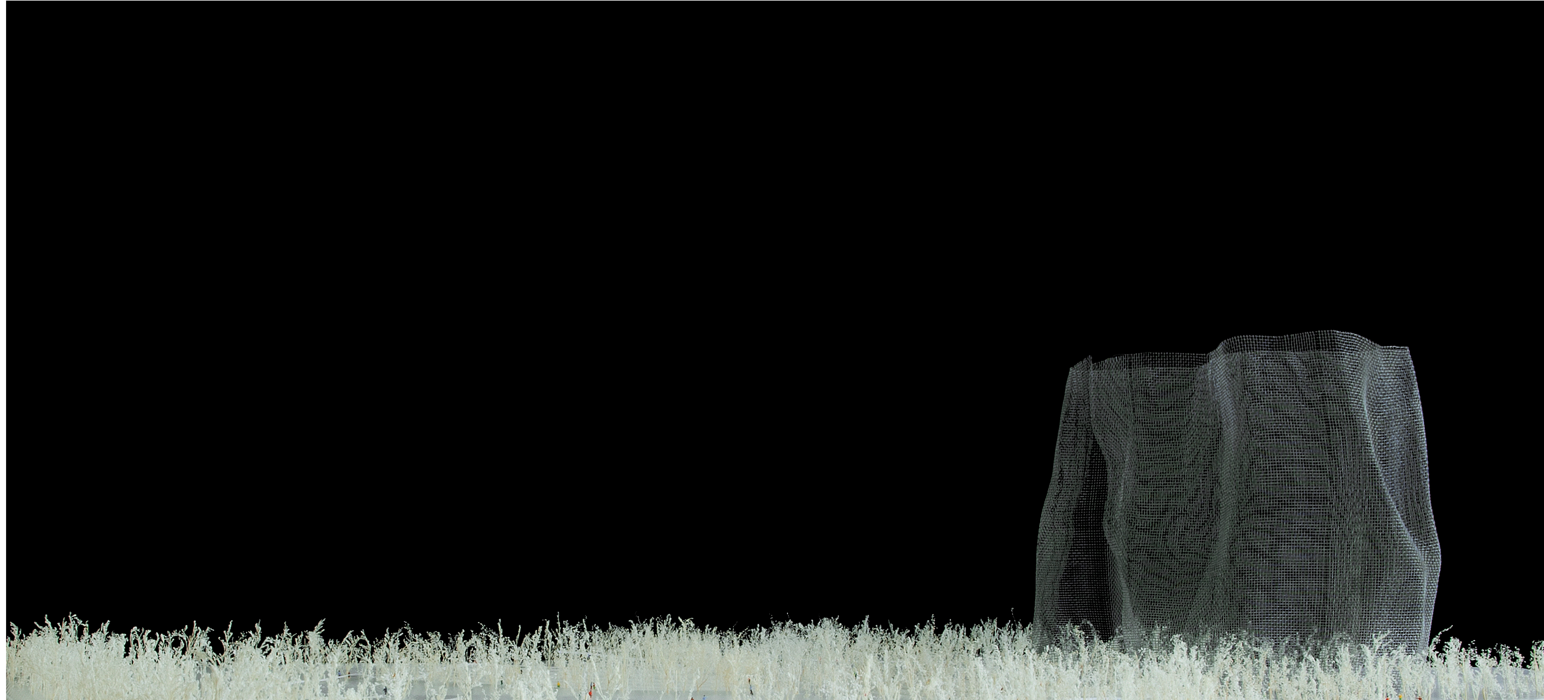
Model northeast. fig. 2