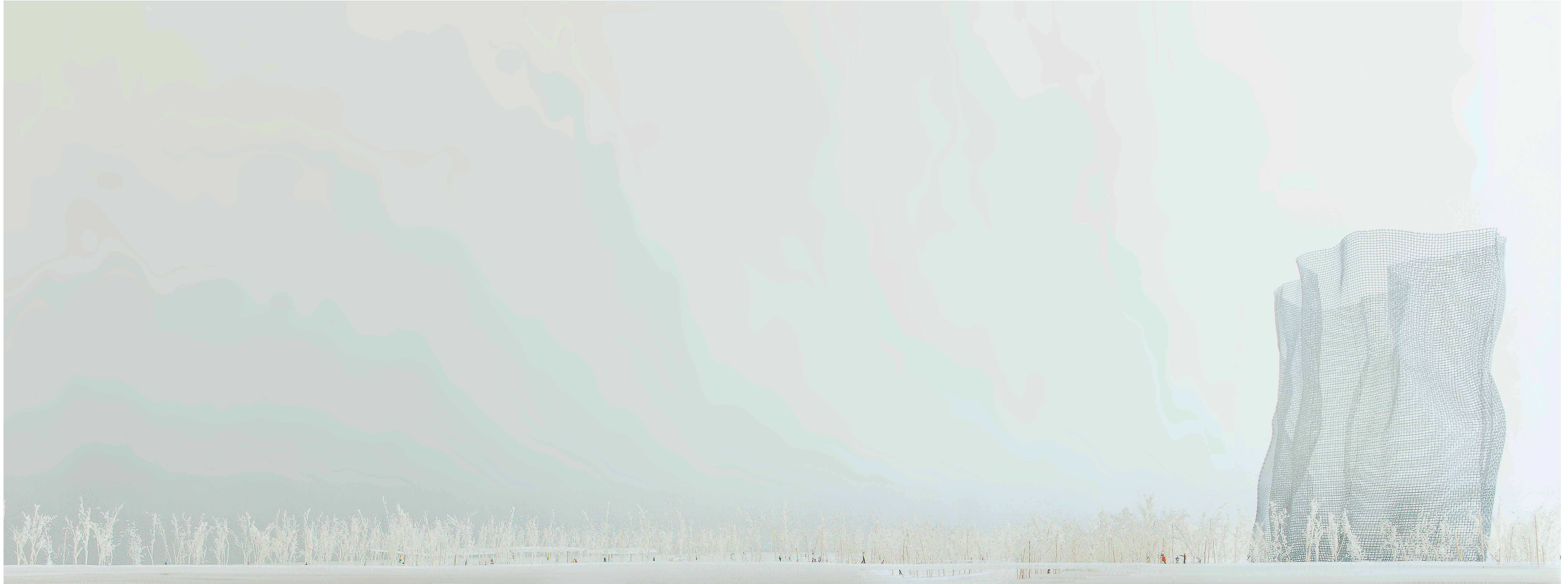
Model north. fig. 1