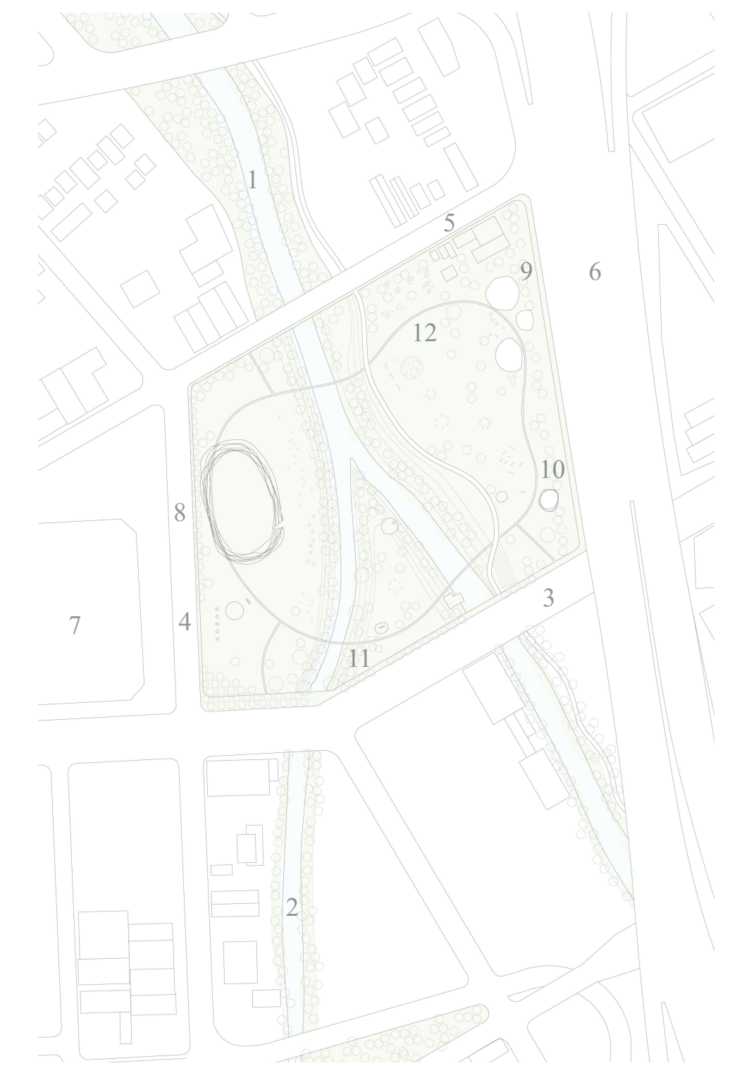
Site plan. fig. 4