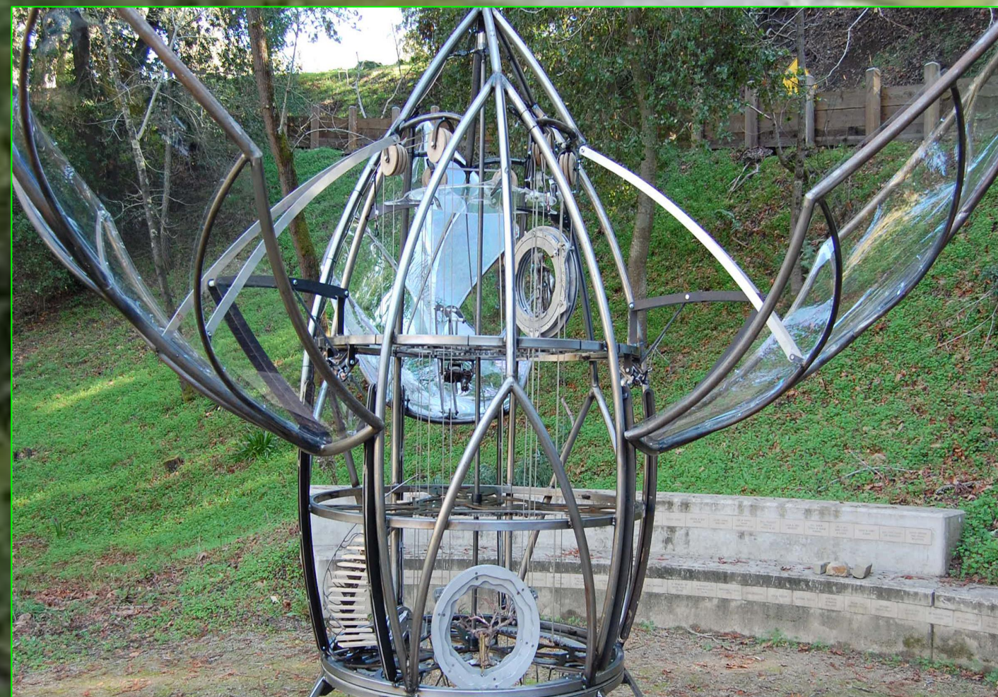
a blossoming flower