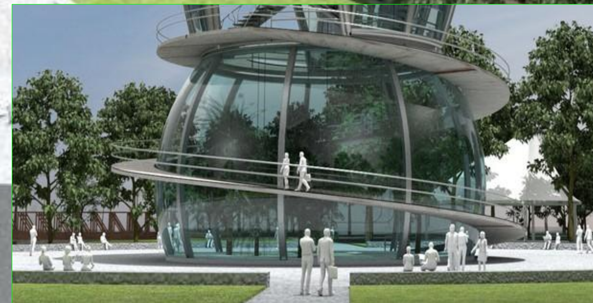
a community congregation hub for civic activity and cross pollination.

Organograph is a call to action on climate change, illustrating the challenges of our dependence on fossil fuels, and elucidating the dynamics of the Earth's carbon cycle.