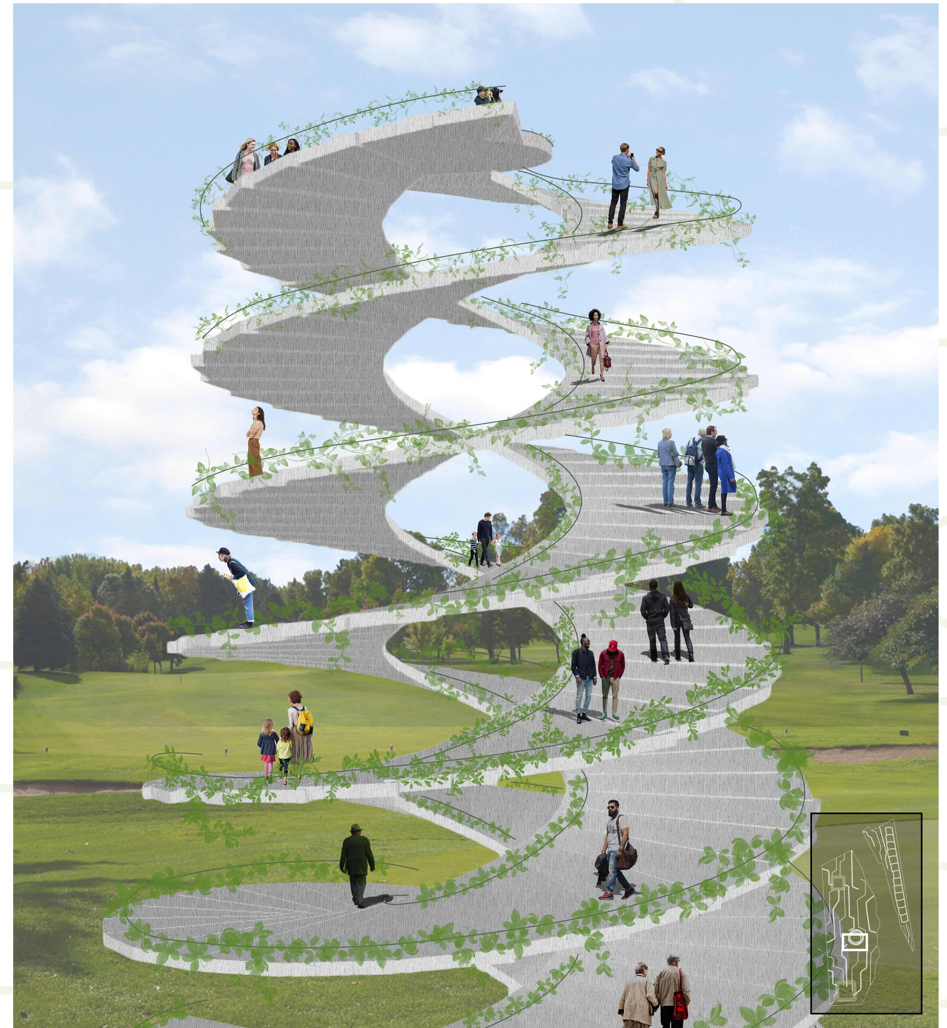
The Helix: Delicately lit and woven with climbing plants, two pathways ascend from the network of circuit-inspired pathways to an elevated viewing platform.