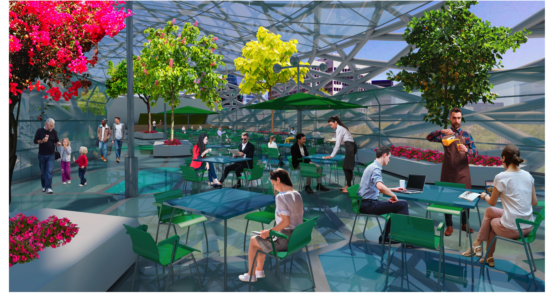
Interior terrace view. Level + 140'.