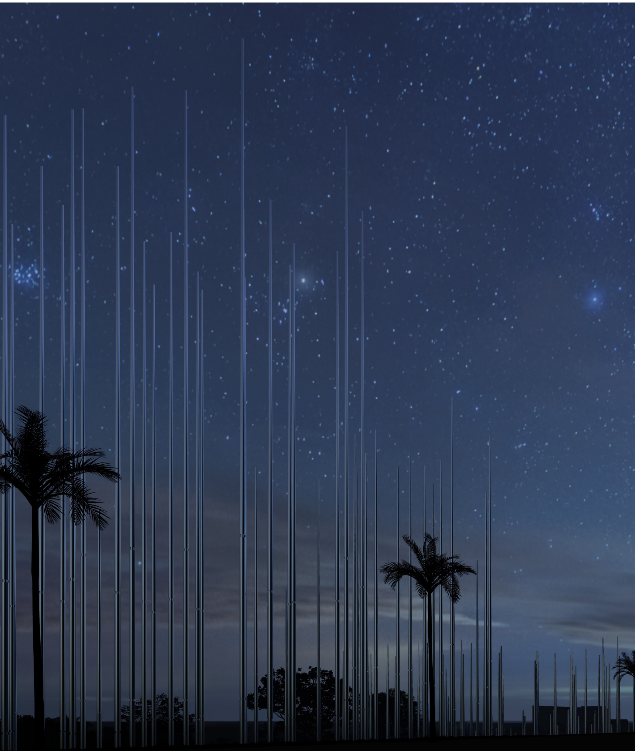
B: LATE NIGHT VIEW FROM CITY / PARKWAY