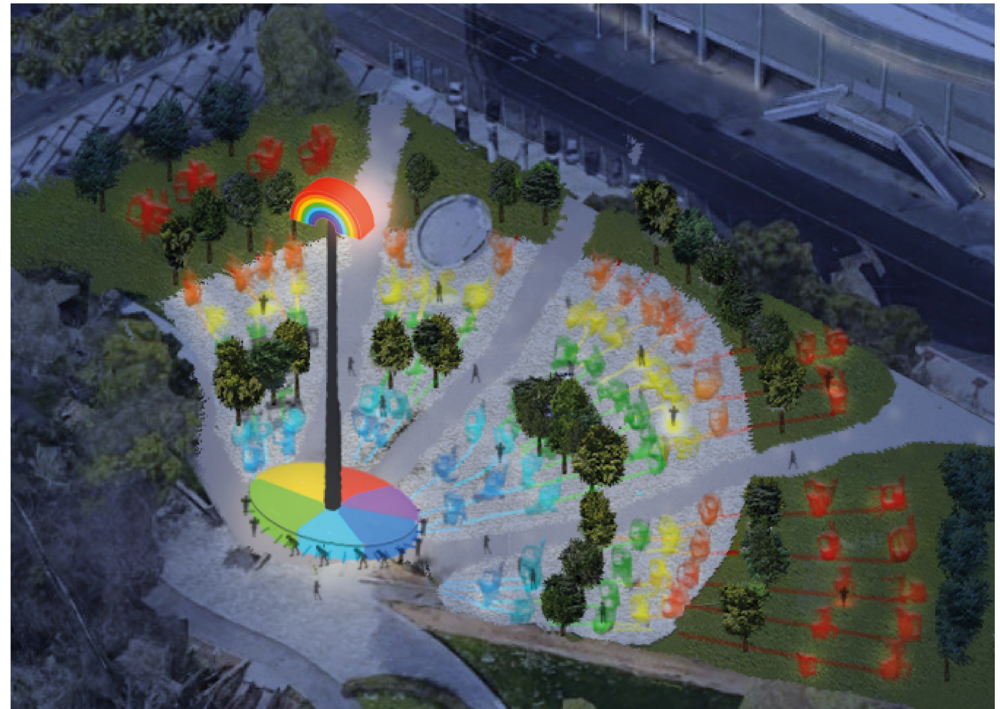
A BEACON THAT BURNS THROUGH THE NIGHT