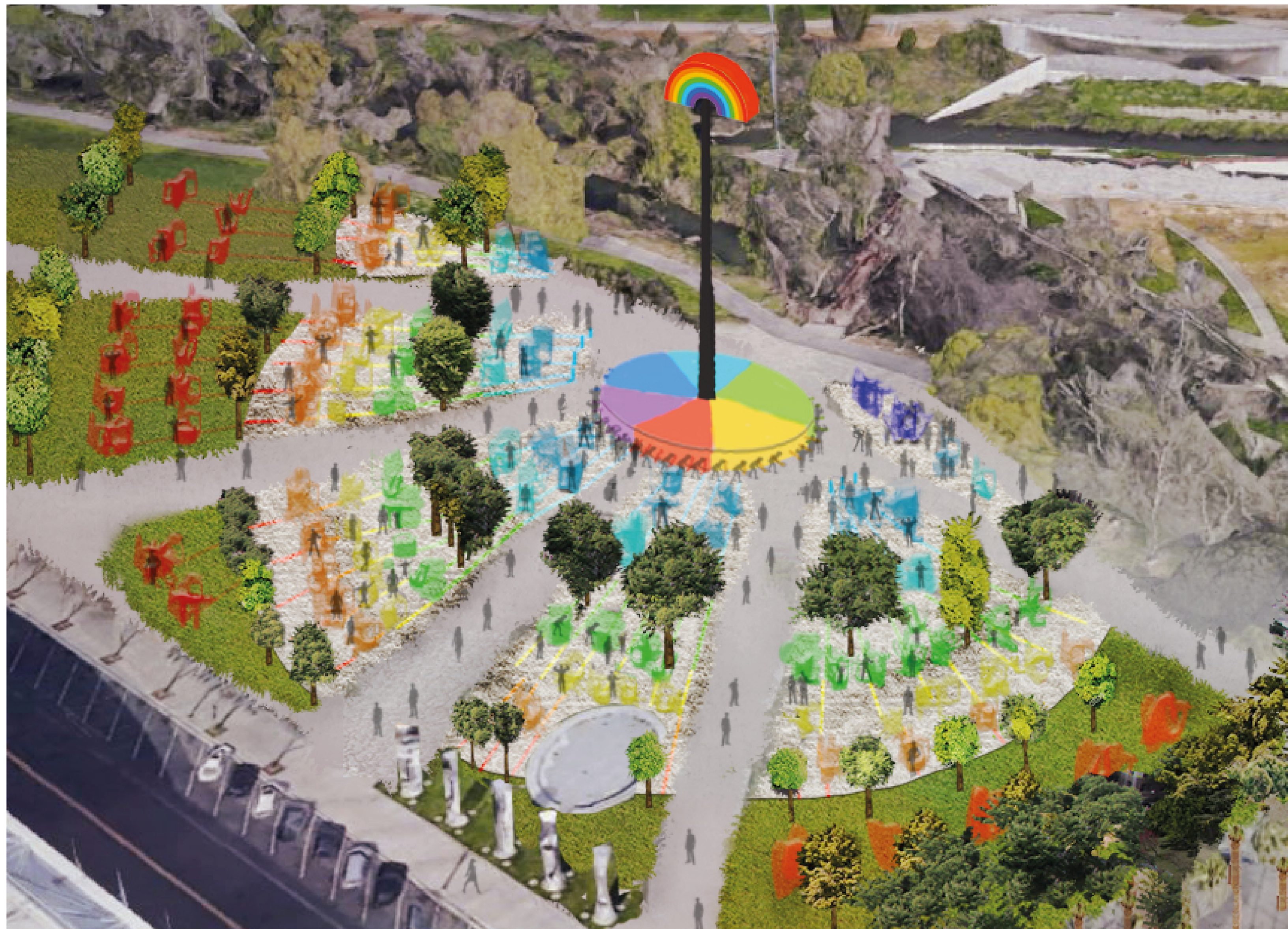
VISIBLE EVEN IN THE SUN

The Rainbow is not just a symbol of fairness, progress and diversity, but also of the need to keep that flame alive. It intentionally needs our interaction for its survival. Giving it our power, gives it its power.