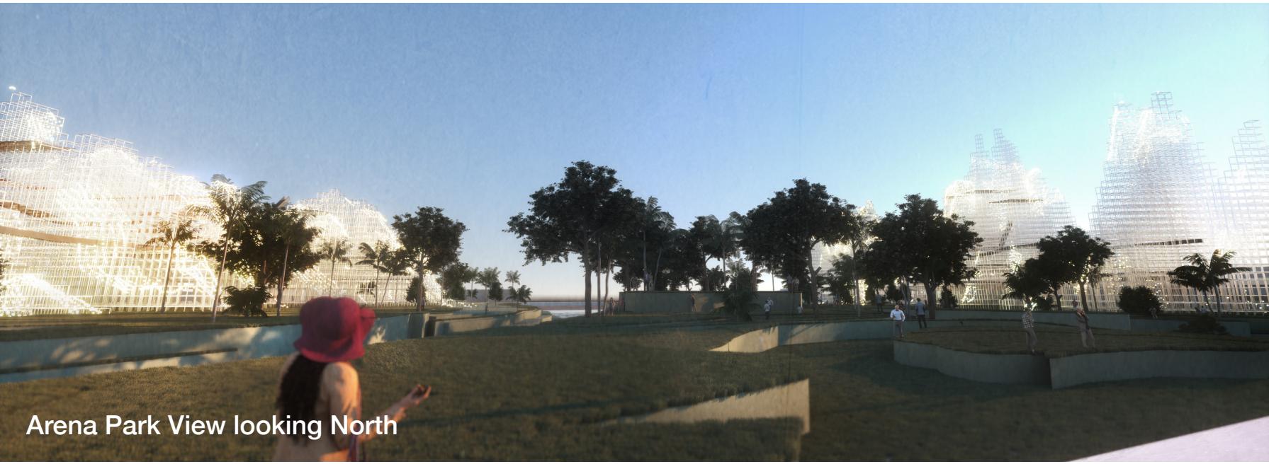
Arena Park View looking North