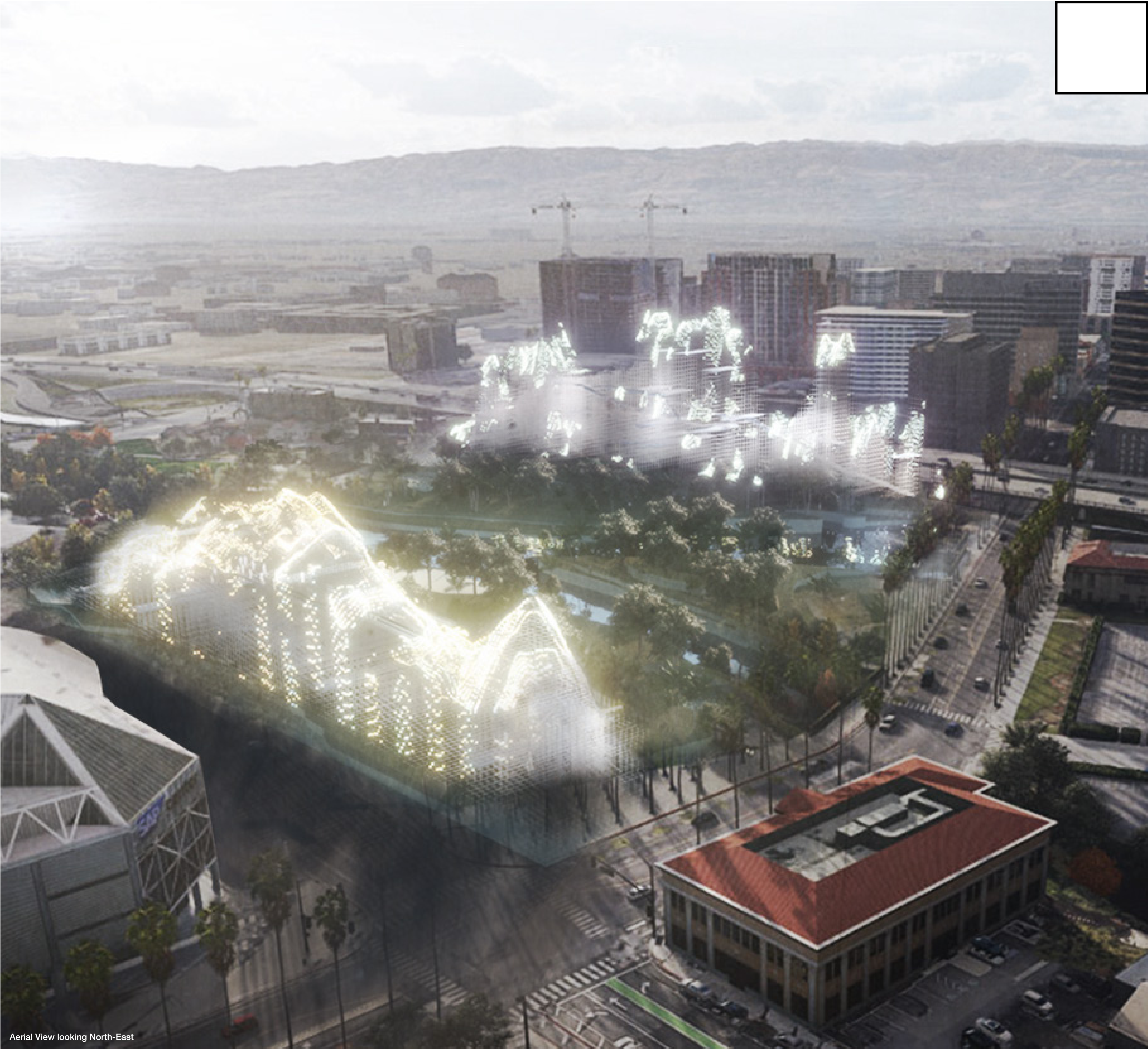
Aerial View looking North-East