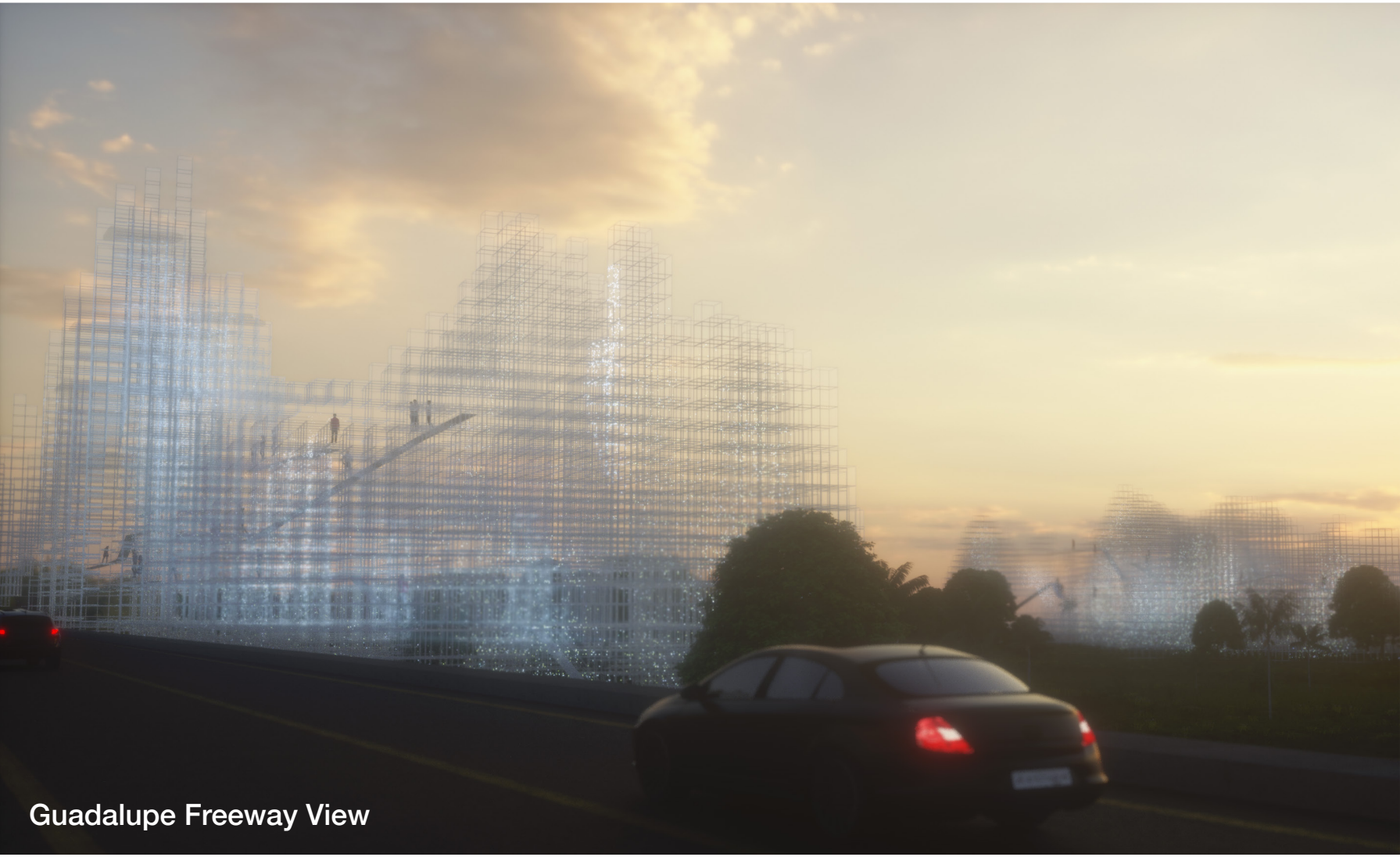
Guadalupe Freeway View