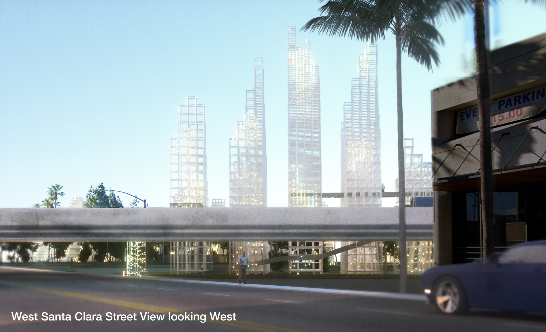
West Santa Clara Street View looking West