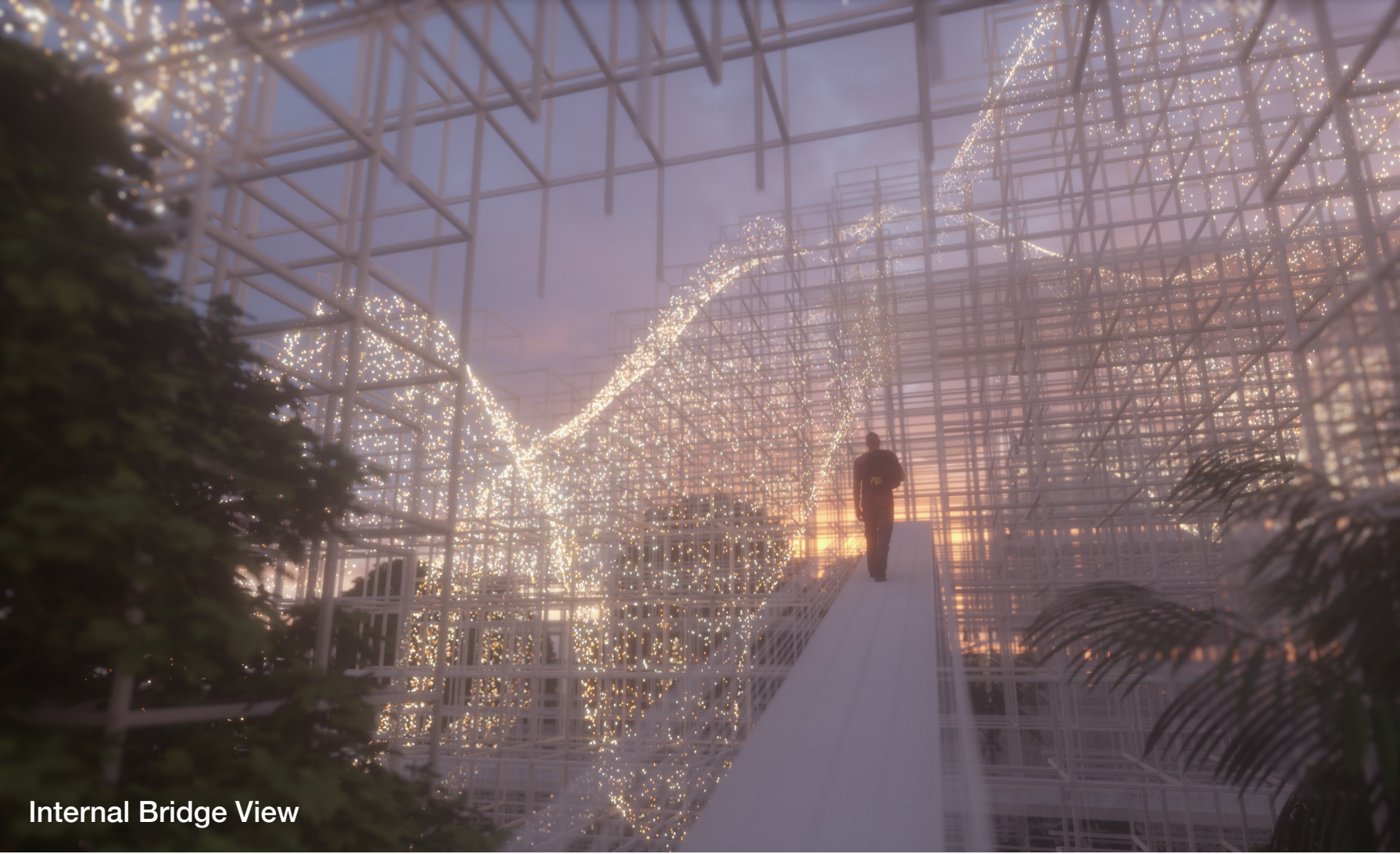
Internal Bridge View