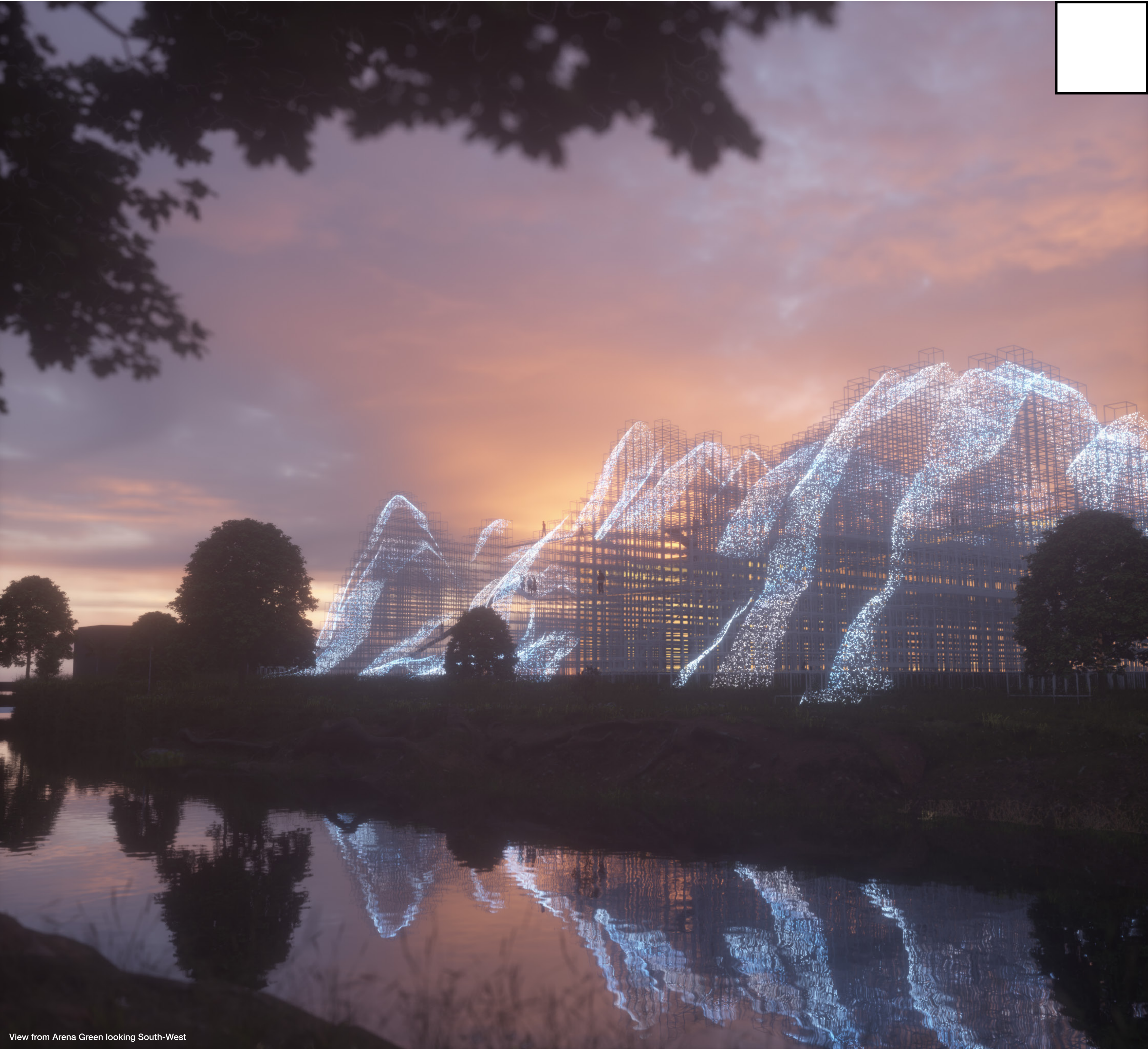
View from Arena Green looking South-West