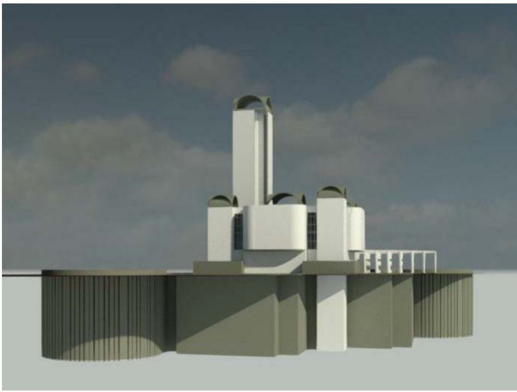
② RENDERING - SOUTHEAST BUILDING ELEVATIONS 12" = 1'-0"