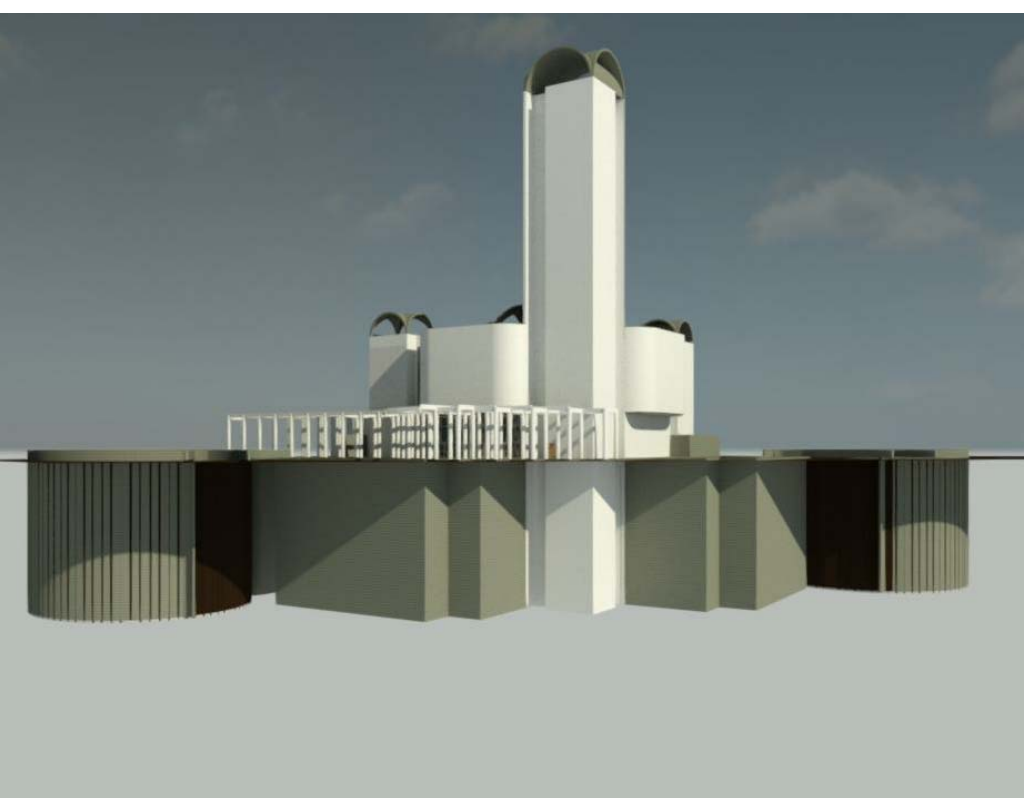
① RENDERING - NORTHWEST BUILDING ELEVATIONS 12" = 1'-0"