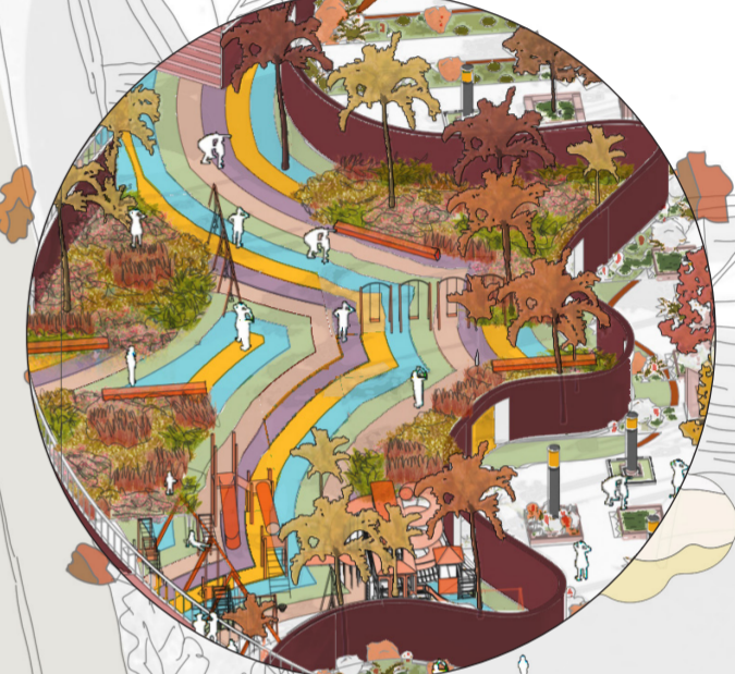
INNER COURTYARD/PLAY AREA