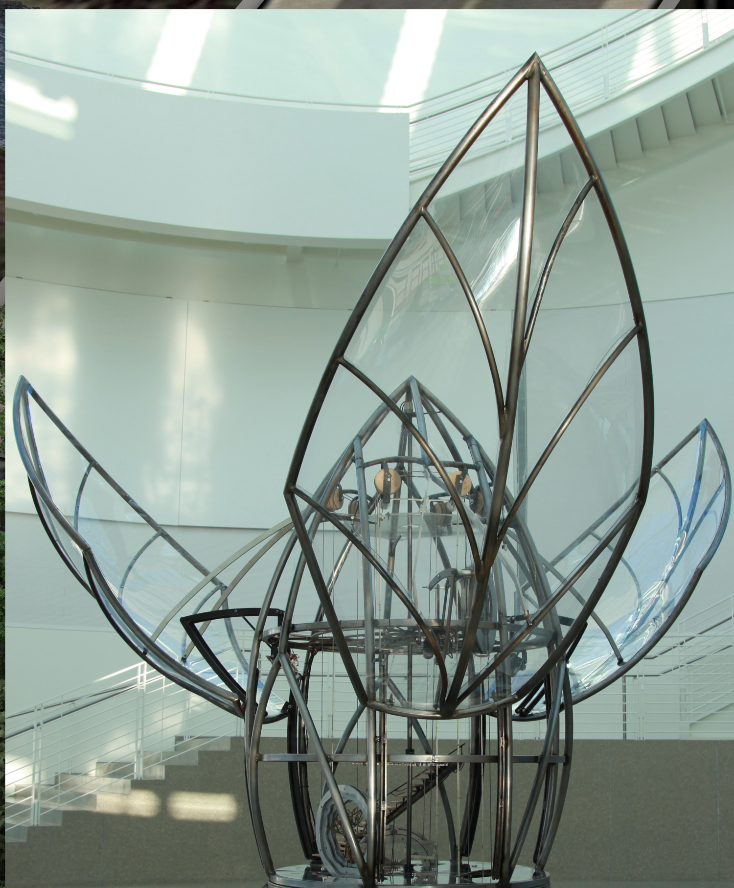
A blossoming heliotropic flower

An iconic artwork for the Urban Confluence competition in San Jose, CA