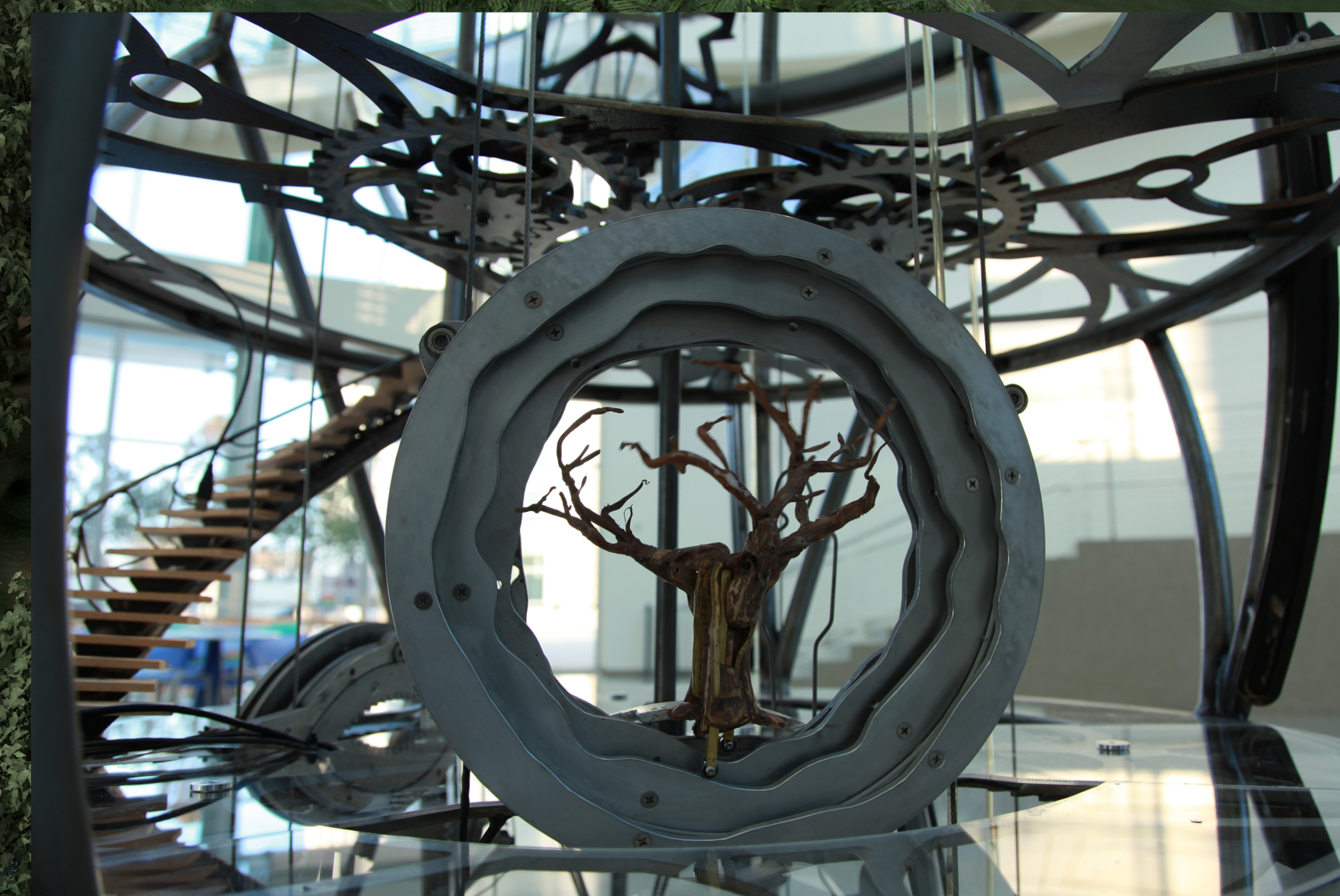
An interactive and engaging climate-change exhibit and call to action