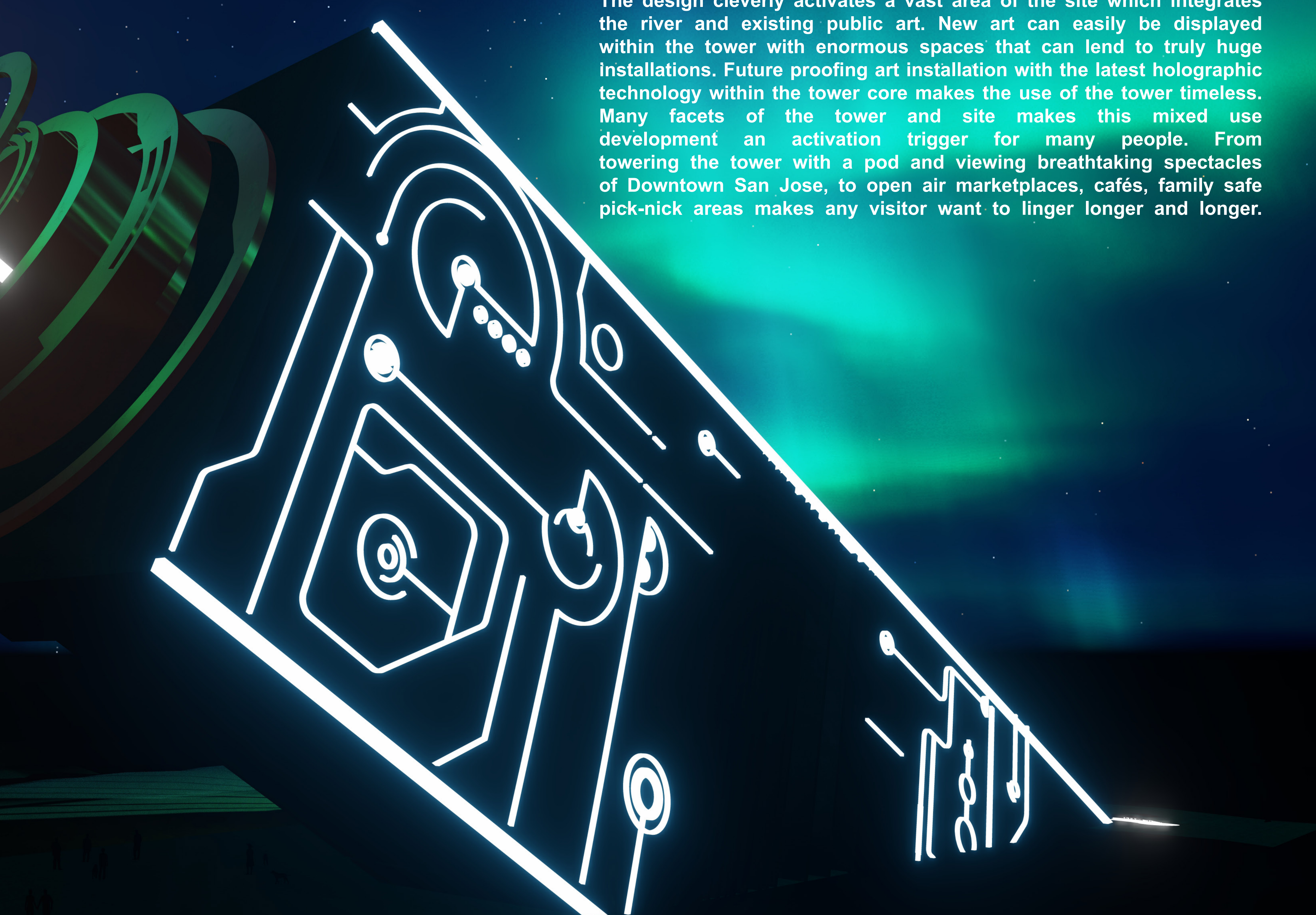
ACTIVATED MIXED USE SPACES

Prideful + firmly situated next to the SAP Center at San Jose rises the LOOM-SPIRE tower to its full might. Weaving together communities through technology and echoing waves of ideas reverberated on the surrounding people. The spirit of San Jose is captured through the magnitude of lighting the tower reveals at night. People plugged into the tower and the tower plugged into them. Attraction to the tower connects people to the world through a strong visual presence the tower demands. The tower's design seamlessly connects to its surroundings by not overpowering the surrounding site. LOOM-SPIRE invokes beauty and affects people on a deeply personal level. The design cleverly activates a vast area of the site which integrates the river and existing public art. New art can easily be displayed within the tower with enormous spaces that can lend to truly huge installations. Future proofing art installation with the latest holographic technology within the tower core makes the use of the tower timeless. Many facets of the tower and site makes this mixed use development an activation trigger for many people. From towering the tower with a pod and viewing breathtaking spectacles of Downtown San Jose, to open air marketplaces, cafés, family safe pick-nick areas makes any visitor want to linger longer and longer.