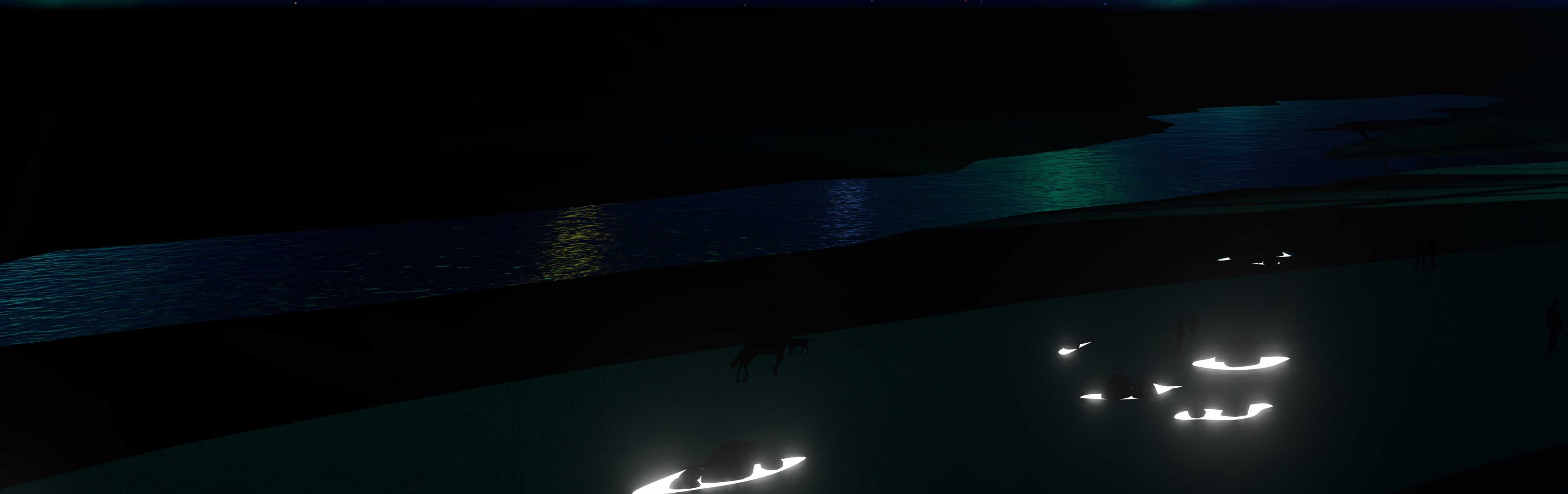
VIEW OF INTERNAL 'TEC SPACE