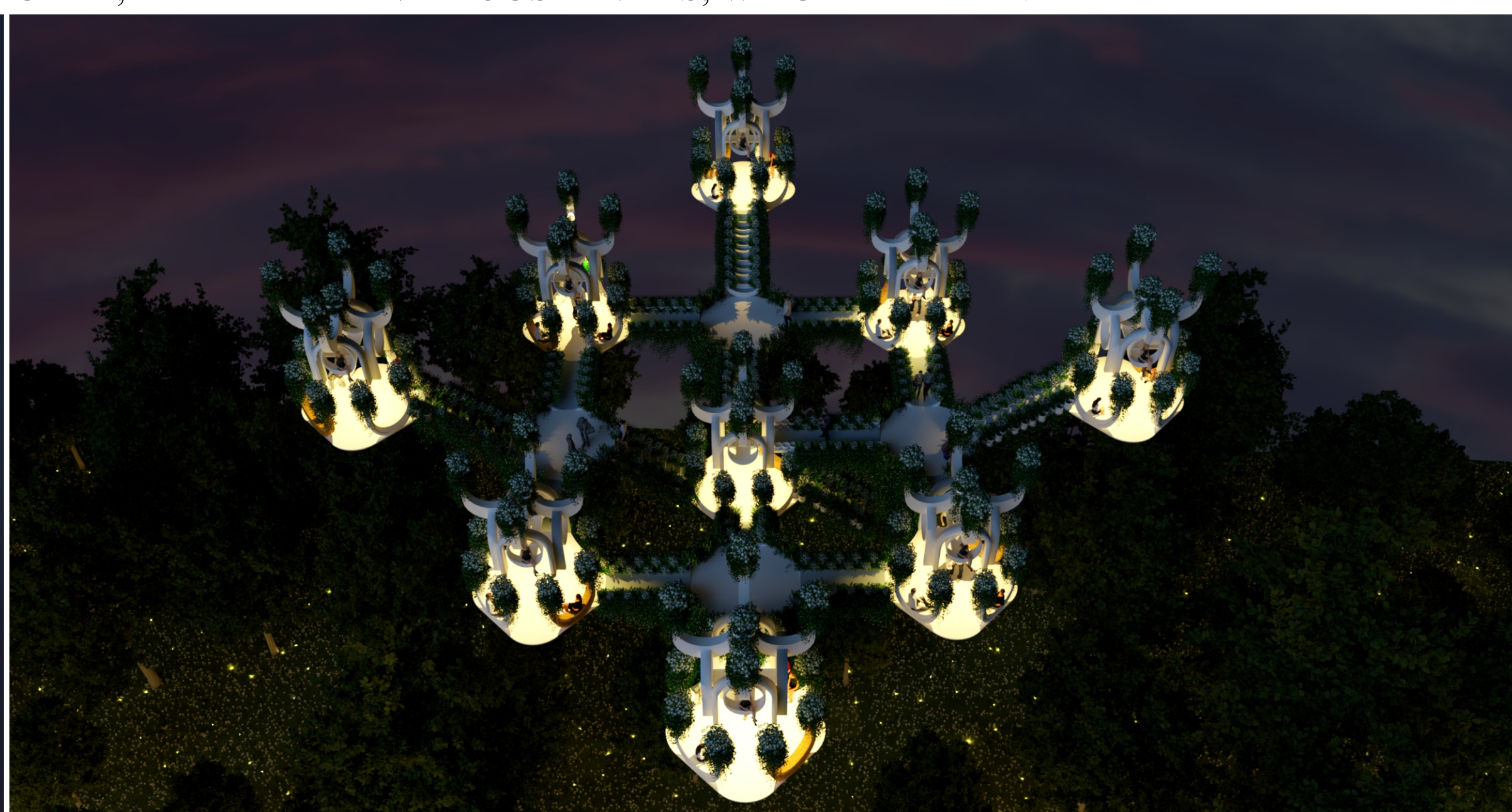
▲ TOGETHER WITH 9 MODULES, MODULE 2 IS FORMED