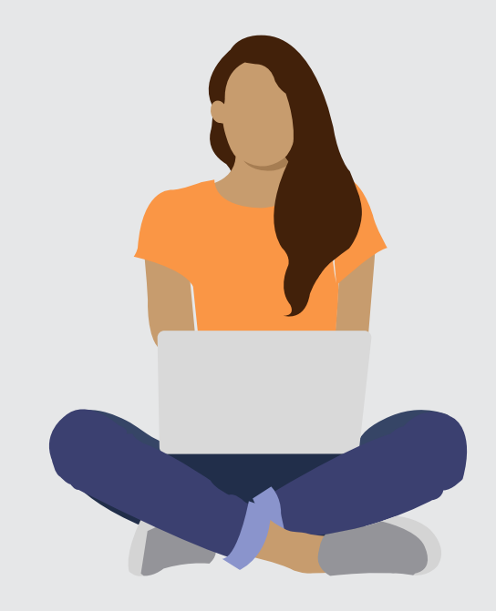
Good digital citizenship helps students make positive decisions online

Digital citizenship creates students who are respectful to their peers and others online, while simultaneously taking care of their personal digital safety and well-being. The greater awareness students have of what good digital citizenship looks like, the more likely they are to make positive decisions online and speak up against cyberbullying.