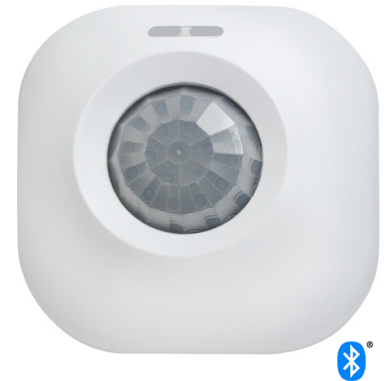
High Bay Sensor, 8-pin

Driver Compatibility: Dimming and on/off control signaling for standard 0-10V ballasts and drivers using linear dimming curve for in LED and fluorescent light fixtures.