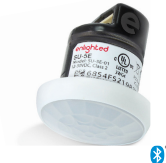
Micro Sensor, 8-pin

Driver Compatibility: Dimming and on/off control signaling for standard 0-10V ballasts and drivers using linear dimming curve for LED and fluorescent light fixtures.