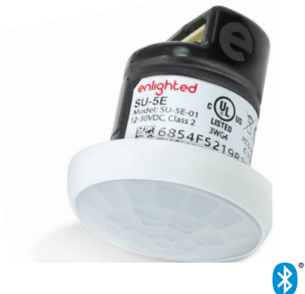
Micro Sensor, 8-pin

Driver Compatibility: Dimming and on/off control signaling for standard 0-10V ballasts and drivers using linear dimming curve for LED and fluorescent light fixtures.