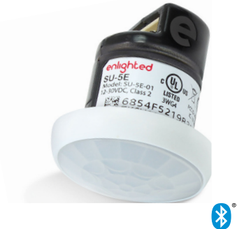
Micro Sensor, 8-pin

Driver Compatibility: Dimming and on/off control signaling for standard 0-10V ballasts and drivers using linear dimming curve for LED and fluorescent light fixtures.