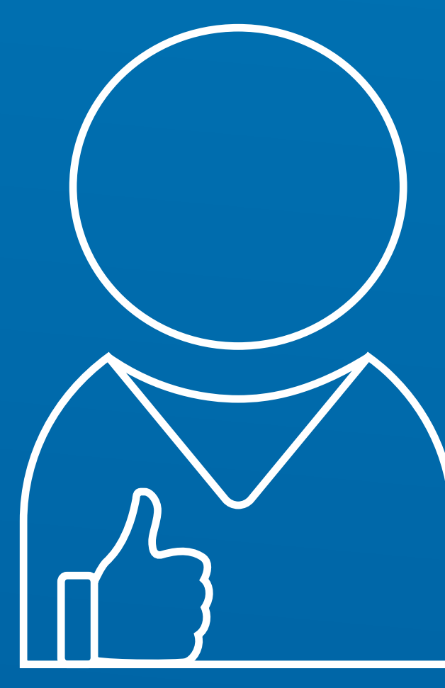
Increased employee retention

With the M1 Mac, the average business projects retention rate improvement of 20% and employee productivity improvement of 5%.