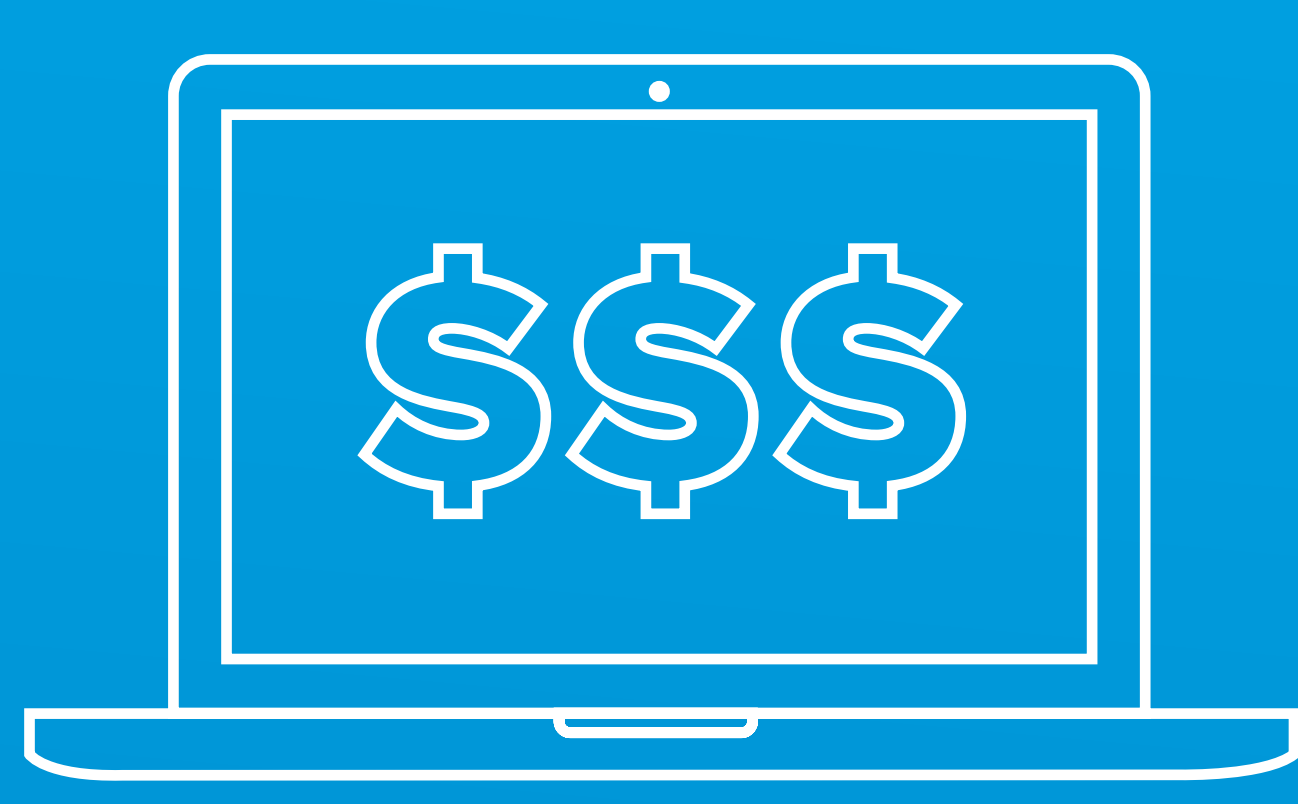
Savings in deployment