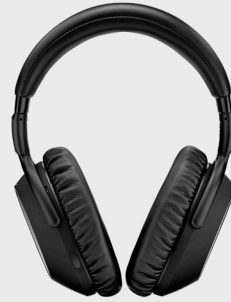
ADAPT 600 Series