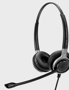
IMPACT 600 Series