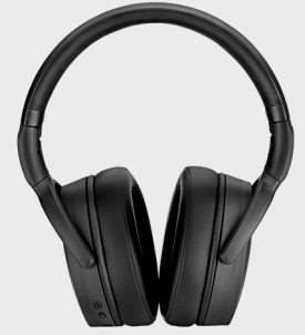
ADAPT 300 Series