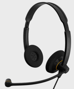
IMPACT 100 Series