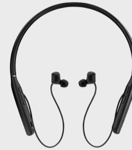
ADAPT 400 Series