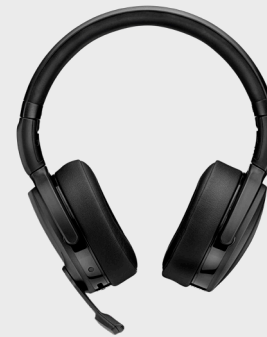
ADAPT 500 Series