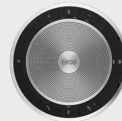
EXPAND 30 Series