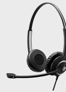
IMPACT 200 Series