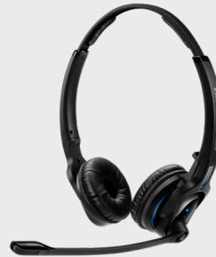
IMPACT MB Pro Series