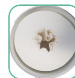
Roll in the Bucket

Now with a custom designed, airtight, flip top lid!