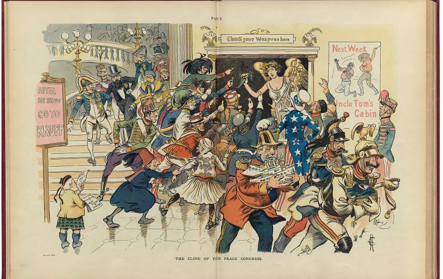
The close of the peace congress. Illustration shows representatives from many foreign nations converging on the figure of Peace who is returning weapons to each ruler, 1907.

Carnegie lived for another five years, but the last entry in his autobiography was the day World War I began. By the time of Carnegie's death in 1919, he had given away $350 million ($4.4 billion in 2010 dollars). Through philanthropy and the pursuit of world peace, Carnegie hoped perhaps that donating his wealth to charitable causes would mitigate the grimy details of its accumulation, and in the public memory, he may have been correct. Today, he is most remembered for his generous gifts of music halls and educational grants, and libraries.