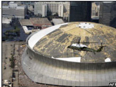
The Superdome, scarred by the hurricane