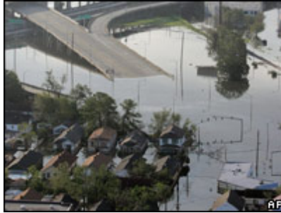
Foodwaters fill the streets of New Orleans