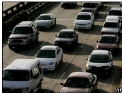
New Orleans residents leave the city