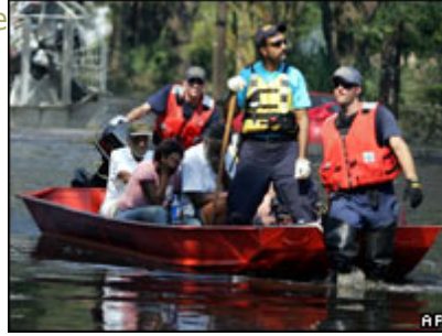
Rescuers bring aid to New Orleans