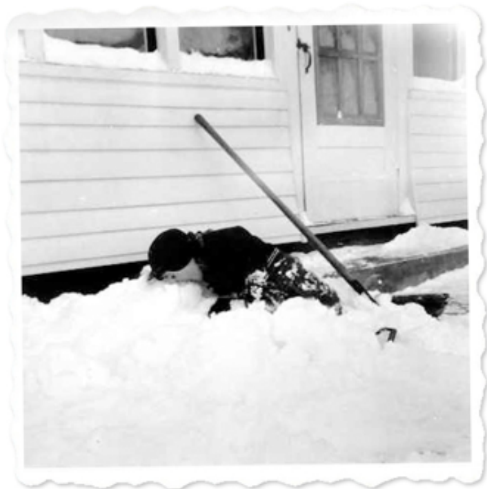
I loved snow days!

I also read lots of things that people consider junk (Nancy Drew, the Hardy Boys, Tom Swift, and zillions of comic books). My only real regret is the time I spent watching television, when I could have been reading instead. (After all, mind is a terrible thing to waste!) The first time I can remember thinking that I would like to be a