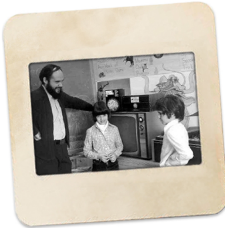
Teaching in the fall of 1978

Like most people, I was not able to start selling my stories right away. So I had many other jobs along the way to becoming a writer, including toymaker, gravedigger, cookware salesman, and assembly line worker. Eventually I became an elementary teacher, and worked with second and fourth graders.