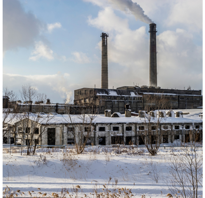
Sakhalin Island LNG, Russia

These are the drivers behind the H21 Leeds City Gate project in the north of England which aims to use hydrogen as a heating fuel in the future energy mix. The project plans to take natural gas from the North Sea and convert that to hydrogen using steam methane reformers (SMRs). Carbon dioxide produced in the process will be captured and stored in an underground carbon capture and storage (CCS) scheme to avoid its release to the atmosphere. The hydrogen can then be distributed in gas pipelines, like the current method of natural gas distribution.