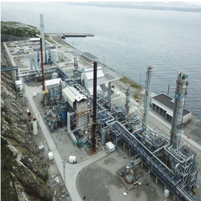
Leeds City Gate, UK

The UK invested heavily in natural gas distribution infrastructure to exploit the benefits of North Sea gas. This has resulted in the country having a high proportion of its heating requirements derived from natural gas. To meet the vision of a de-carbonised future, an alternative heating source must be found. Whilst electricity from renewable sources is often spoken of as a green fuel, its application for power-hungry heating would be a stretch for the renewables sector in the short term.