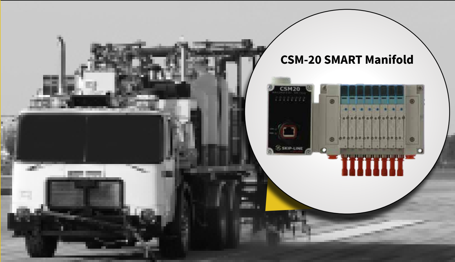
CSM-20 SMART Manifold