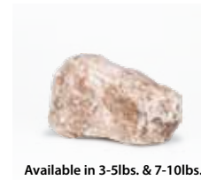
Available in 3-5lbs. & 7-10lbs.

Redmond Equine Minerals helps you make the most of the relationship you have with your horse by providing valuable trace minerals he needs to live a more healthy, balanced life.