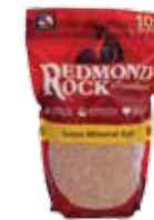
Available in 5lbs. & 25lbs.

Daily Gold™ is a naturally occurring Montmorillonite clay that contains 60+ trace minerals and elements – the building blocks of life. Daily Gold helps remineralize the body, promotes ulcer relief, maintains hydration, and binds toxins.