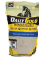
Available in 4.5lbs. & 25lbs.

Redmond Rock on a Rope™ is ideal for hanging in a barn, stall, or on a fence post. You know your horse will get more than 60 trace minerals and electrolytes in a natural blend only nature could have made.