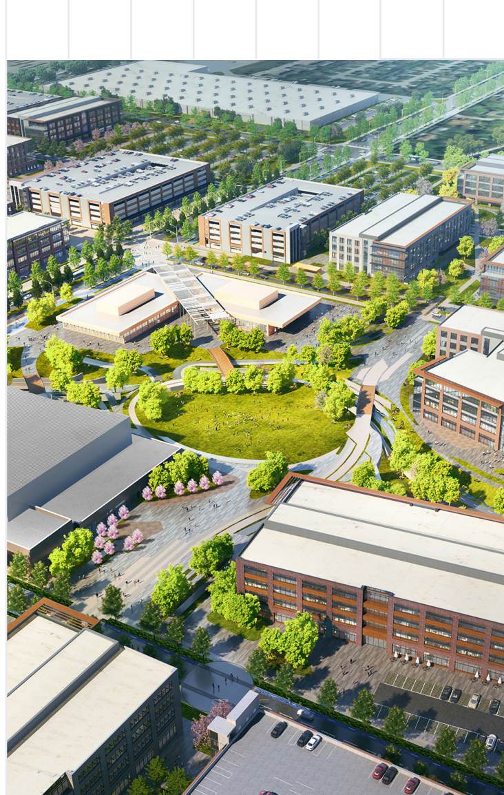
RENDERINGS | Fast + Epp

To provide locally sourced materials for this project and throughout the region, Structurlam opened a new mass timber fabrication facility in Conway, Arkansas, that has created over 100 new jobs to date. This new plant will help further a new timber industry in the southern and eastern United States. Walmart expects the full campus to be completed in 2025.