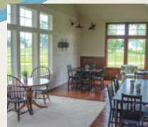
MEETING ROOM AND OUTDOOR PAVILION

Turn onto Fulbrook Road, about one mile west of downtown Fulshear. Welcome Center is on the left near the pavilion.