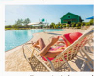
Resort style pool