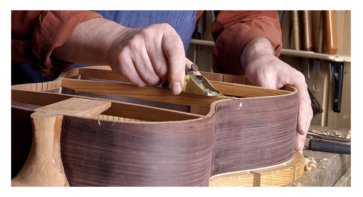
Figure 1: Guitar manufacturing, Source: (Voigt-Luthiers Gitarren, 2018).