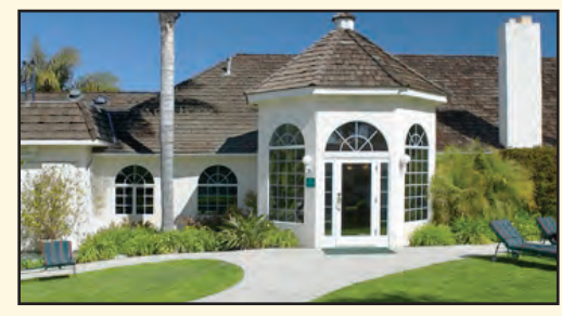
OHI - San Diego

265 Cedar Lane, Cedar Creek, TX 78612 (512) 303-4817 or (800) 993-4325