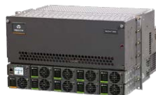
NetSure™ DC Power System for Wireless Access