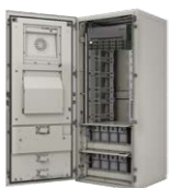
Vertiv™ XTE 801 Series Network Edge Enclosure

Increase power system density for ensured continuity as you scale distributed assets to meet growing demand.