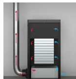
Vertiv™ VRC Rack Cooling System, 3500 Watts