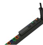
Vertiv™ Geist™ Universal Power Distribution Unit