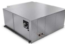
Liebert® Mini-Mate Ceiling-Mounted Cooling System, 3.5-28 kW