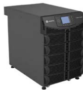
Liebert® APS 5kVA - 20kVA Modular UPS