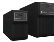
Liebert® PSA5 500-1500 VA Line-Interactive UPS