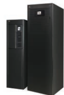
Liebert® EXS 3PH 10kVA, 208V UPS