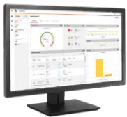
Vertiv™ Environet™ Alert