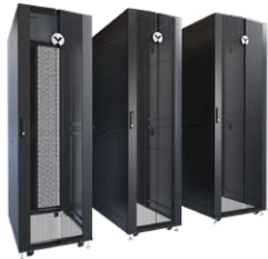
Vertiv™ VR Rack

Support and protect your critical IT and facilities with scalable, modular equipment storage solutions.