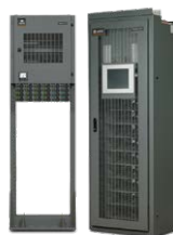
NetSure™ DC Power Solutions