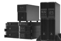
Liebert® PSI5 750-5,000 VA AVR Line-Interactive UPS