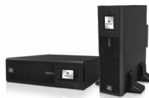
Liebert® ITA2 3PH 10kVA, 208V UPS