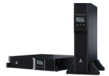
Liebert® PSI5 1500-3000 VA Lithium-Ion Line-Interactive UPS