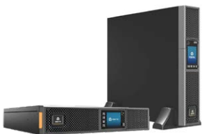
Vertiv™ Liebert® GXT5 500-10,000 VA Online Double Conversion UPS