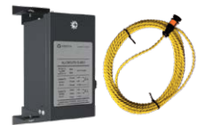
Liebert® Point Leak Detection Sensors and Cable