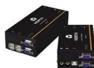
Vertiv™ Avocent LongView KVM Extender