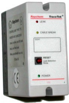
Figure 8. Non-locating Single Alarm Module

Leak detection sensors can be connected to numerous types of monitoring devices. The simplest monitor connects to a single probe or cable and provides an alarm as soon as it detects a leak. These types of modules do not locate the leak but usually include a switching relay for on/off control of a pump or valve to stop the leak.