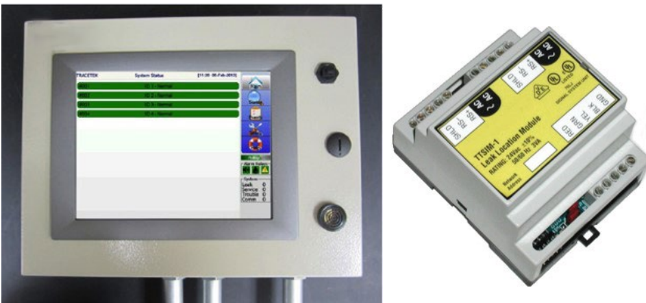
Figure 9. Locating Alarm Modules

Other module types include modules that connect multiple cables, probes and other sensors and include detection and full location capabilities. A wide variety of user interfaces are also available. In most cases, these modules are connected to Building Management Systems (BMS) or similar instrumentation or security monitoring systems.