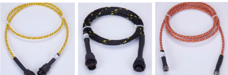
Figure 6. Example Cable Sensors

Again, cable sensors come in a variety of types for different applications such as detecting water, acids, caustic, and other aqueous chemicals. Figure 6 includes examples of cable sensors.