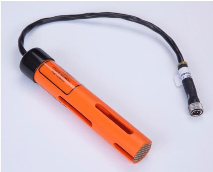
Figure 5. Example Fast Fuel Sensor

Emergency generators are currently used in the majority of data centers for backup power. Leaks from generators or their fuel tanks are not only a significant fire safety hazard but a significant threat to business continuity. Many of these generators are located in basements or below ground where water or moisture may be present. A specialty probe for quickly identifying a fuel leak is shown in Figure 5. This probe is designed to ignore water but identify fuel leaks including films floating on top of water. Such detectors comply with performance standards outlined in Factory Mutual Standard FM 7745.