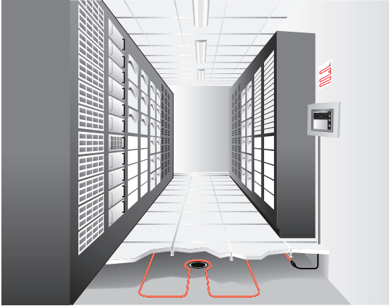
Figure 7. Example Leak Detection Cable Under Raised Floor or In Server Racks

A unique feature of some cable sensors is the ability of not only identifying that a leak occurred, but to accurately determine where along the cable the leak occurred. For example, when used under a raised floor or within a server rack as illustrated in Figure 7, a leak touching one portion of the cable would trigger the monitoring electronics to identify which specific floor tile or rack position to investigate.