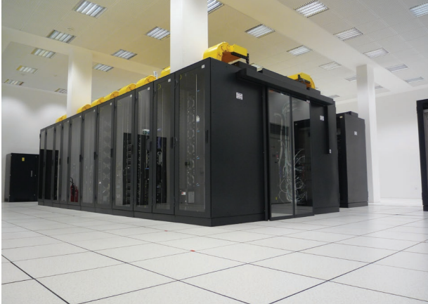
Figure 1. Typical Data Center

Although they are rarely seen or thought of by the average individual, data centers are critical to nearly every aspect of our day to day existence.