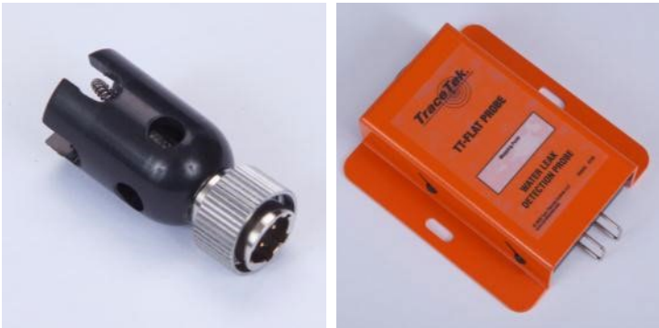
Figure 4. Example Point Contact Probes

Leak sensors are available in a wide variety of shapes and sizes. The simplest type include probe or point sensors. When used to detect conductive fluids such as water, acid, or caustic, the probes consist of two-point contacts which send a signal when the conductive fluid touches both points at the same time.