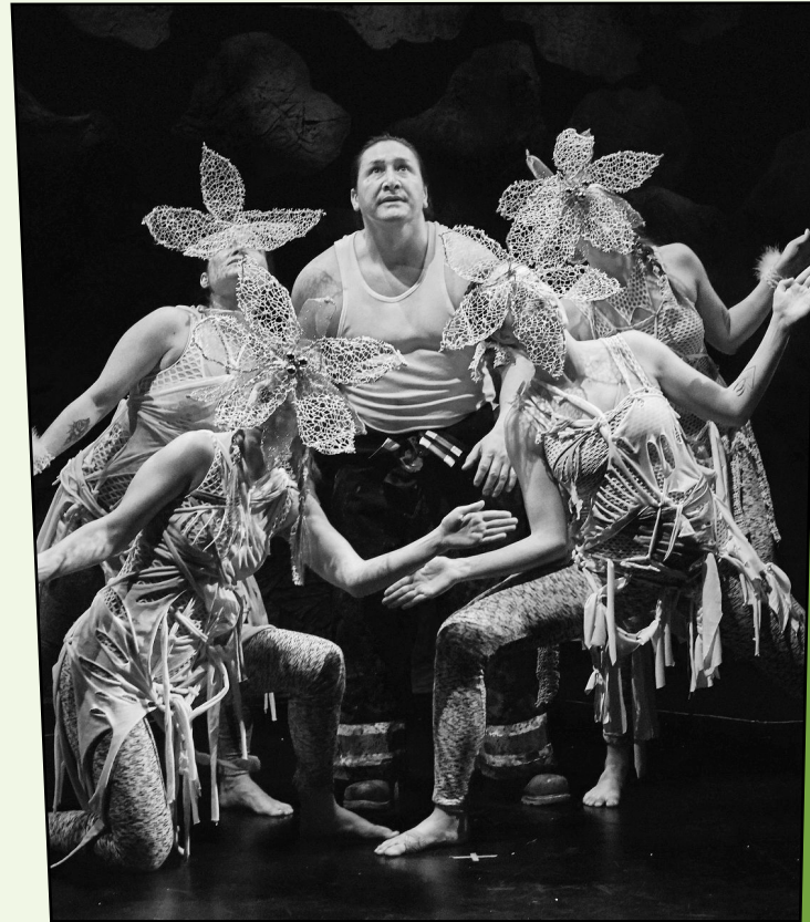
Pictured: Punctuate! Theatre & Alberta Aboriginal Performing Arts production of Bears presented at Factory Theatre February 2018.