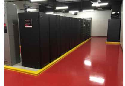
One equipment room showing Liebert NXL UPS.

For the Dublin data center, phase one of three included dual power A/B feeds using (2) Liebert NXL 800kVA UPS systems (plans call for two more to follow) and (16) Liebert PPC 225kVA PDUs each configured at 480V in, 208V out. Auxiliary power is provided by multiple diesel generators for reliable, redundant operation that allows concurrent maintainability. Notes Dzurko, “We rely on the Liebert NXL UPS because it is designed to handle all severe power conditions simultaneously and still support 100% of our load with no need for derating.”