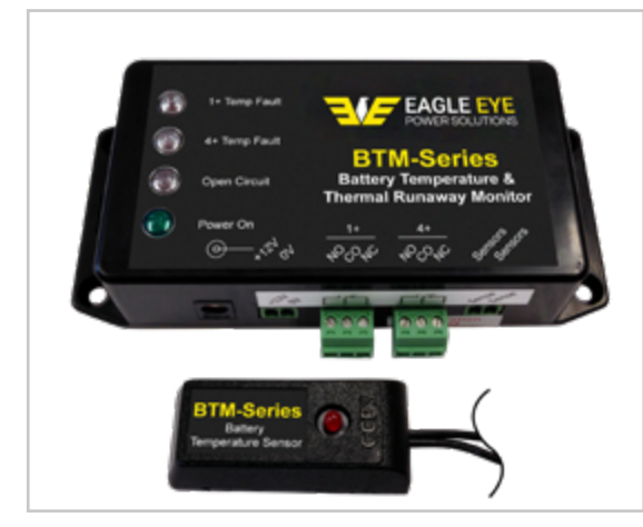
BTM-Series Monitor & Sensor