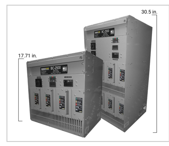
BC-2500 4 & 8-Slot Chassis (16-Slot Not Pictured)

Common Applications: Stationary, substation, utility, switchgear, process control, & industrial applications